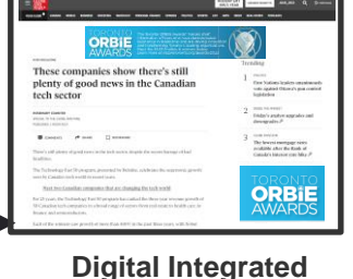
Special Report Ads rotate with SOV among advertisers.