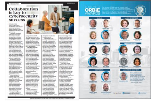
Full page ad