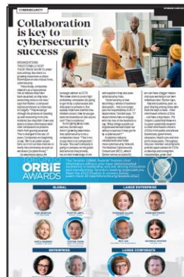
1/2 page ad