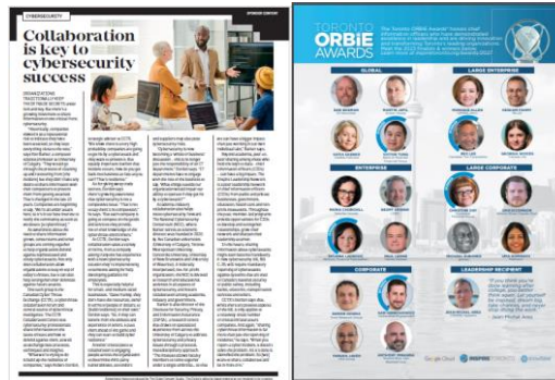
Full page ad